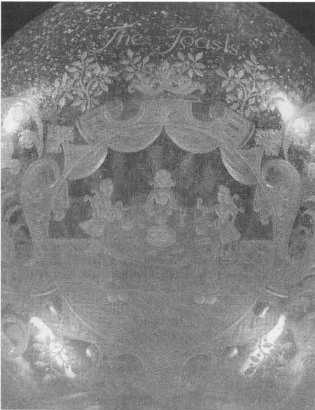
FIG. 3 The Kit-Cat Club decanter: detail of reverse 'The toasts'

such that Robert Walpole records that though its members were generally mentioned as a 'set of wits', they were in reality the patriots who saved Britain. The club consisted of at least 39 members, all men of the first rank and quality of learning, most of whom were at times employed in the greatest offices of state, or in the army, and none were admitted but those of high distinction in one way or another.