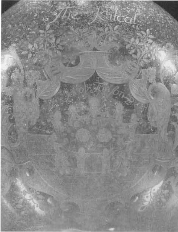
FIG. 2 The Kit-Cat Club decanter: detail of obverse 'The Kitcat'